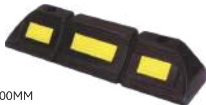
Wheel Stopper Size L: 500X W-125X H-100MM