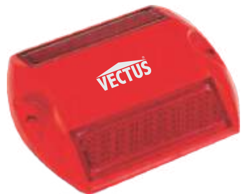
Size L: 100X W-90X H-20MM