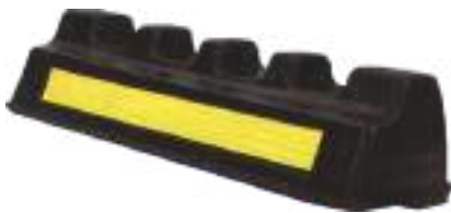
Wheel Stopper Size L: 500X W-160X H-125MM