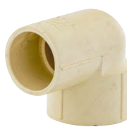
Elbow 90° Brass