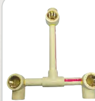
Wall Mixer Top & Bottom

6" • 20x15 6" • 25x15 7" • 20x15 7" • 25x15