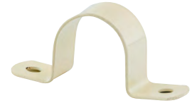
Pipe Clip - Metal