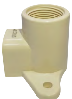
Wall Mounted Female Elbow (Plastic)

6" • 20x15 6" • 25x15 7" • 20x15 7" • 25x15**