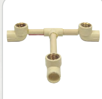
Wall Mixer Top & Side

6" • 20x15 6" • 25x15 7" • 20x15 7" • 25x15**