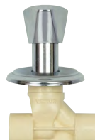
Concealed Valve Qtr. Turn & Full Turn