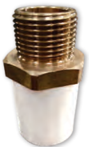
Male Adapter Brass Threaded - MABT (Hex)

20x15 25x15 25x20 32x15 32x25 40x15 40x25 40x32 50x15 50x20 50x25 50x32 50x40 65x50 80x50 100x50