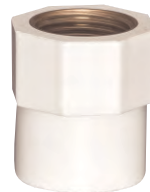
Reducing Female Adapter Brass Threaded - RFABT