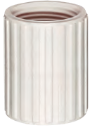
Female Adapter Plastic Threaded- FAPT