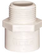
Male Adapter Plastic Threaded-MAPT