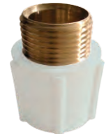
Reducing Male Adapter Brass Threaded - RMBAT