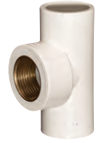
Female Tee Brass Threaded - FTBT