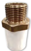
Male Adapter Brass Threaded - MABT (Hex)

20x15 25x15 25x20 32x15 32x25 40x15 40x25 40x32 50x15 50x20 50x25 50x32 50x40 65x50 80x50 100x50