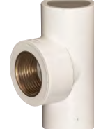
Female Tee Brass Threaded - FTBT