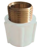
Reducing Male Adapter Brass Threaded - RMABT