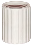
Female Adapter Plastic Threaded- FAPT