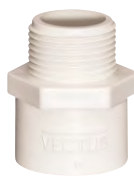
Male Adapter Plastic Threaded-MAPT