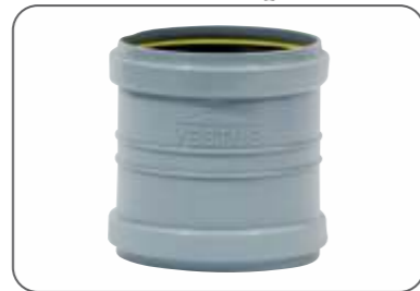
ISI - Coupler