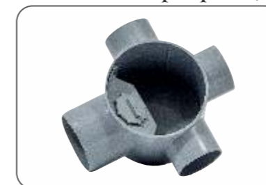
Multi Floor Trap Square Jali