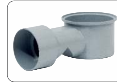
N Trap Without Jali