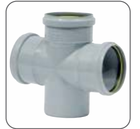
Cross Tee Plain