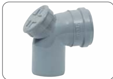
ISI - Door bend 87.5°