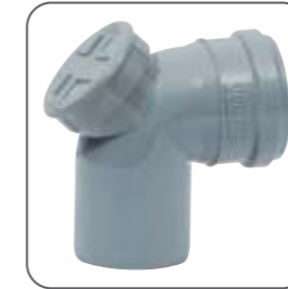
Door bend 87.5°