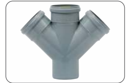
Double Y Plain