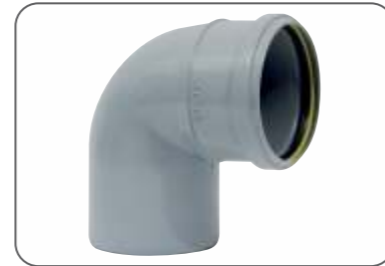
ISI - Bend 87.5°