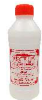
PVC Solvent Cement