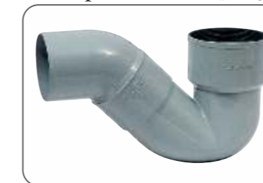
P trap Small (with Lip Ring)