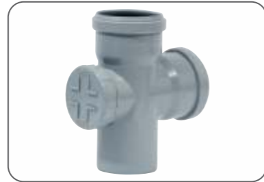
ISI - Reducing Door Tee