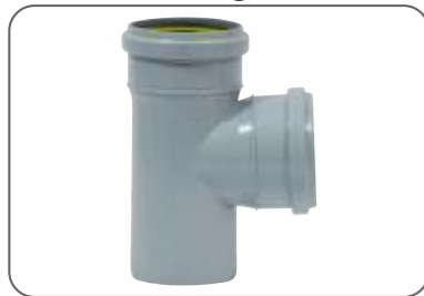
ISI - Single Tee