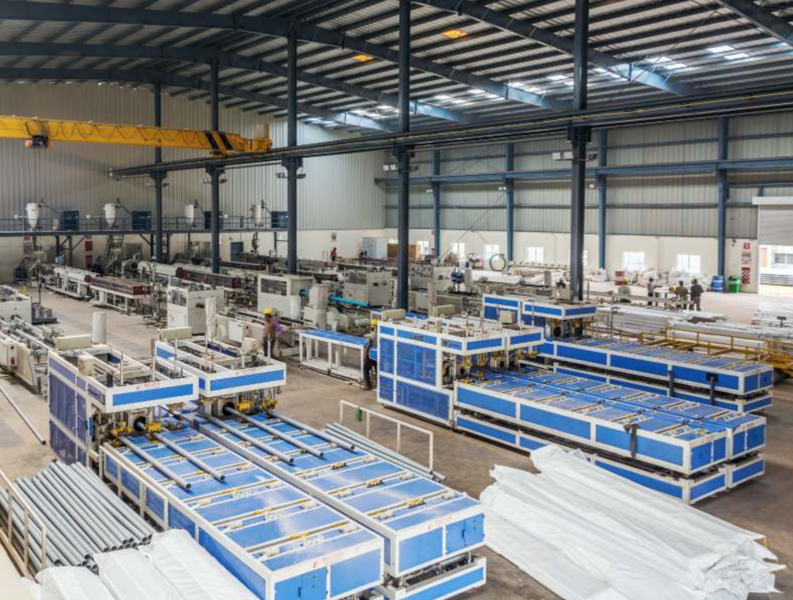
Vectus Pipes Plant at Gwalior, Madhya Pradesh