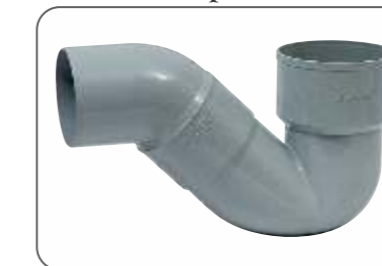
P Trap Small