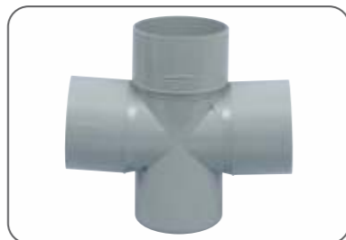
Cross Tee Plain