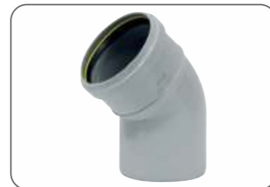
ISI - Bend 45°