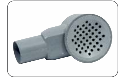
N Trap With Jali