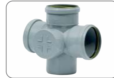
Cross Tee With Door