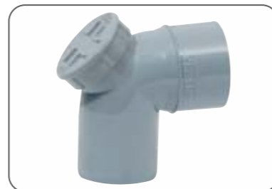
Door Bend 87.5°