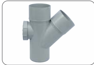
Single Y with Door