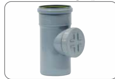
ISI - Cleaning Pipe