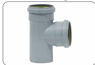
ISI - Reducing Tee