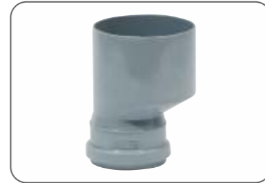
ISI - Reducer