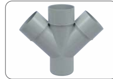
Double Y Plain