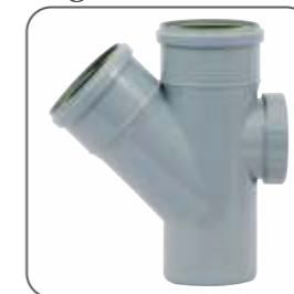
Single Y with Door