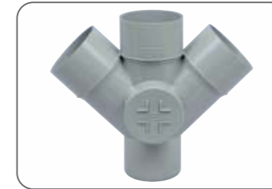
Double Y with Door