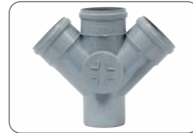
Double Y with Door