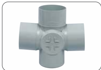
Cross Tee With Door